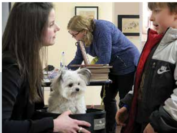
Right: Creature Teachers Snake presentation