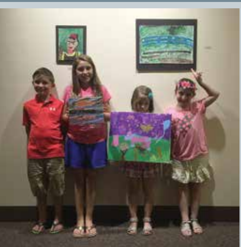
Young artists from the Summer Sampler Show

The remainder of the season was all “Kid stuff,” a sampler of school vacation projects by local youth.