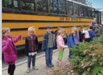
Kids lining up for the bus