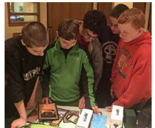
Magic the Gathering club