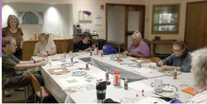
Adults Mixed Media workshop