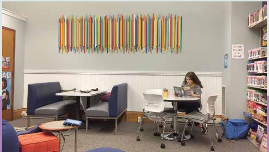
The back wall in the photo (right) displays the newly commissioned artwork: 'the adventures of an open mind' by Rosemary Pierce

"To encourage the mind to be curious, intrigued, uplifted, inspired... bringing shape & color alive in a way that boosts the spirit... that is my daily passion." -Rosemary Pierce. Ours, too!