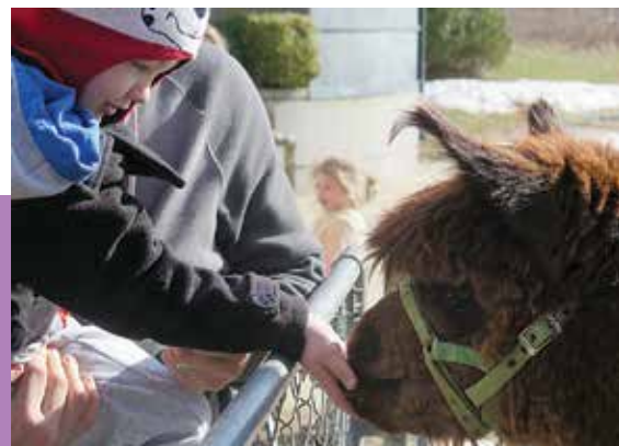
Right: Luina Greine Farm alpacas